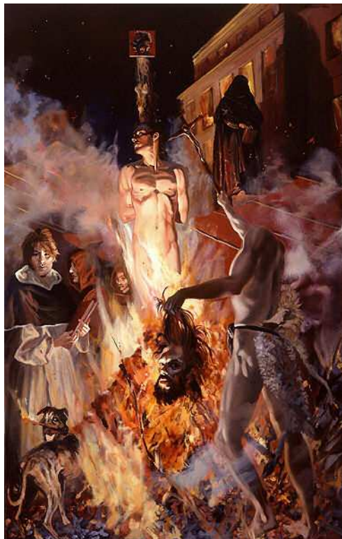
Picture: A Modern Rendition Of Burning At Stake, A Very Painful, Agonizing, And Slow Method Of Killing People

had made a pact with the devil. Soon after two women were accused of sorcery, and that due to sorcery they are spreading plague. Thus they were burnt alive on 7 March 1545.